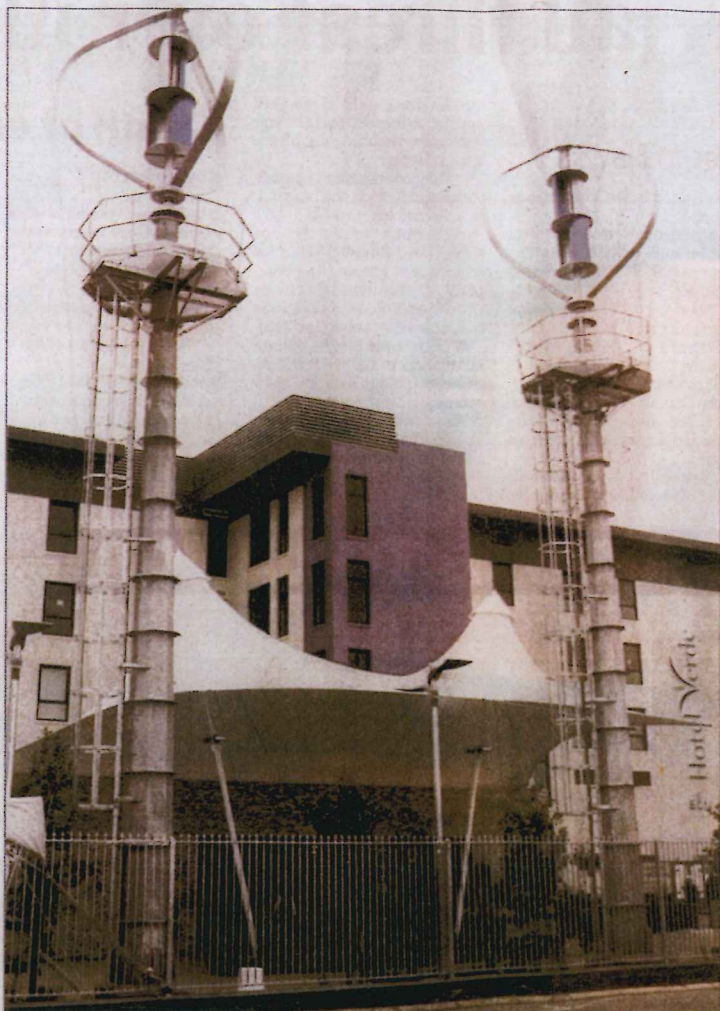
NEW LOOK: The reception of Hotel Verde, which was officially opened yesterday. The hotel was built with concrete slabs containing recycled materials.

The hotel cost about R20 million more than a normal hotel, but they are confident that they will make the